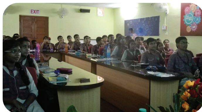
Students attending NDLI User Workshop at DAV Model School