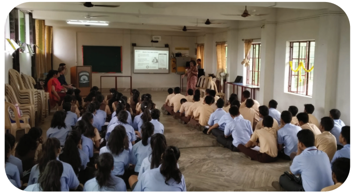
Students attending NDLI User Workshop at Splendour School Kharagpur