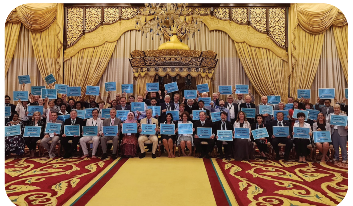
The Conference of Directors of National Libraries at IFLA WLIC 2018

The third session was on impact assessment. Interestingly, digital libraries across the world are looking at impact assessment rather critically. Impact assessment is both necessary for evolution of our libraries and also for the practical cause of more funding. Digital Libraries itself being a nascent phenomenon, compounded by its wide scope and formative technology infrastructure poses many questions when it comes to impact at this stage. The session had tremendous learnings for an infant library like NDLI where we looked at case studies from more mature counterparts like Library of Congress, Qatar Digital Library and Trove.