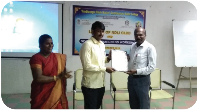
NDLI Club User Workshop at Virudhunagar Hindu Nadars' Senthikumara Nadar College