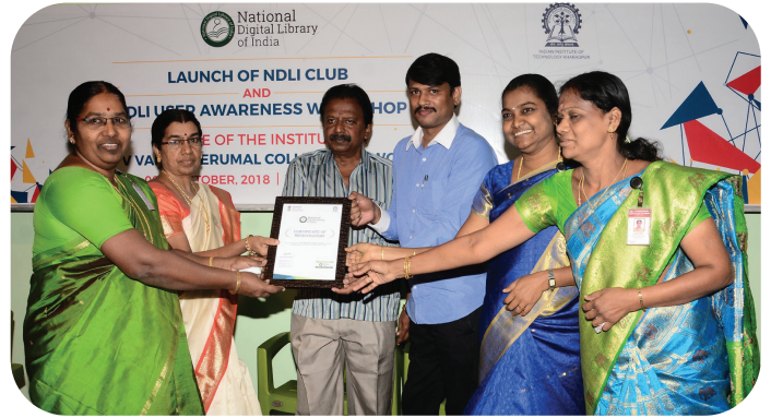
NDLI Club Launch Program at V V Vanniaperumal College for Women Virudhunagar Tamil Nadu