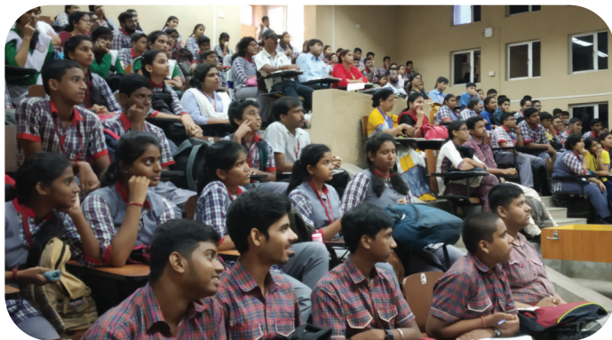
NDLI User Workshop in 68th Foundation Day of IIT Kharagpur