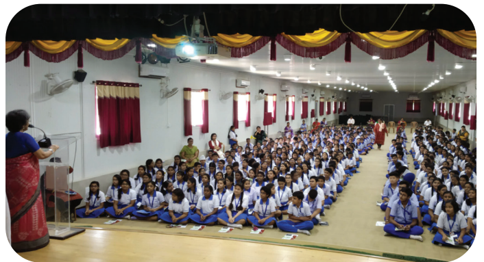
Students attending NDLI User Workshop at St. Agnes School, Kharagpur