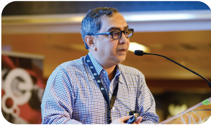
Team NDLI presenting on Aggregation in the Wilderness

EuropeanaTech 2018 placed tech firmly at the centre of the European Year of Cultural Heritage and brought together an international network of technical and R&D specialists from memory organisations, research institutions and creative industries to share innovative progress and forecast the technical future of digital cultural heritage. The event took place on the 15th and 16th of May, 2018 at the SS Rotterdam, The Netherlands.