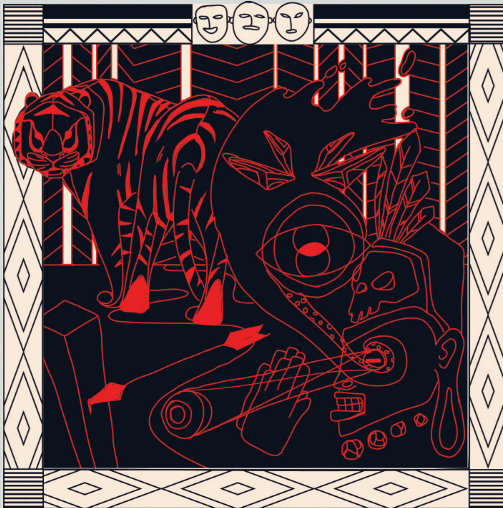
Folktale - Man, Spirit and Tiger