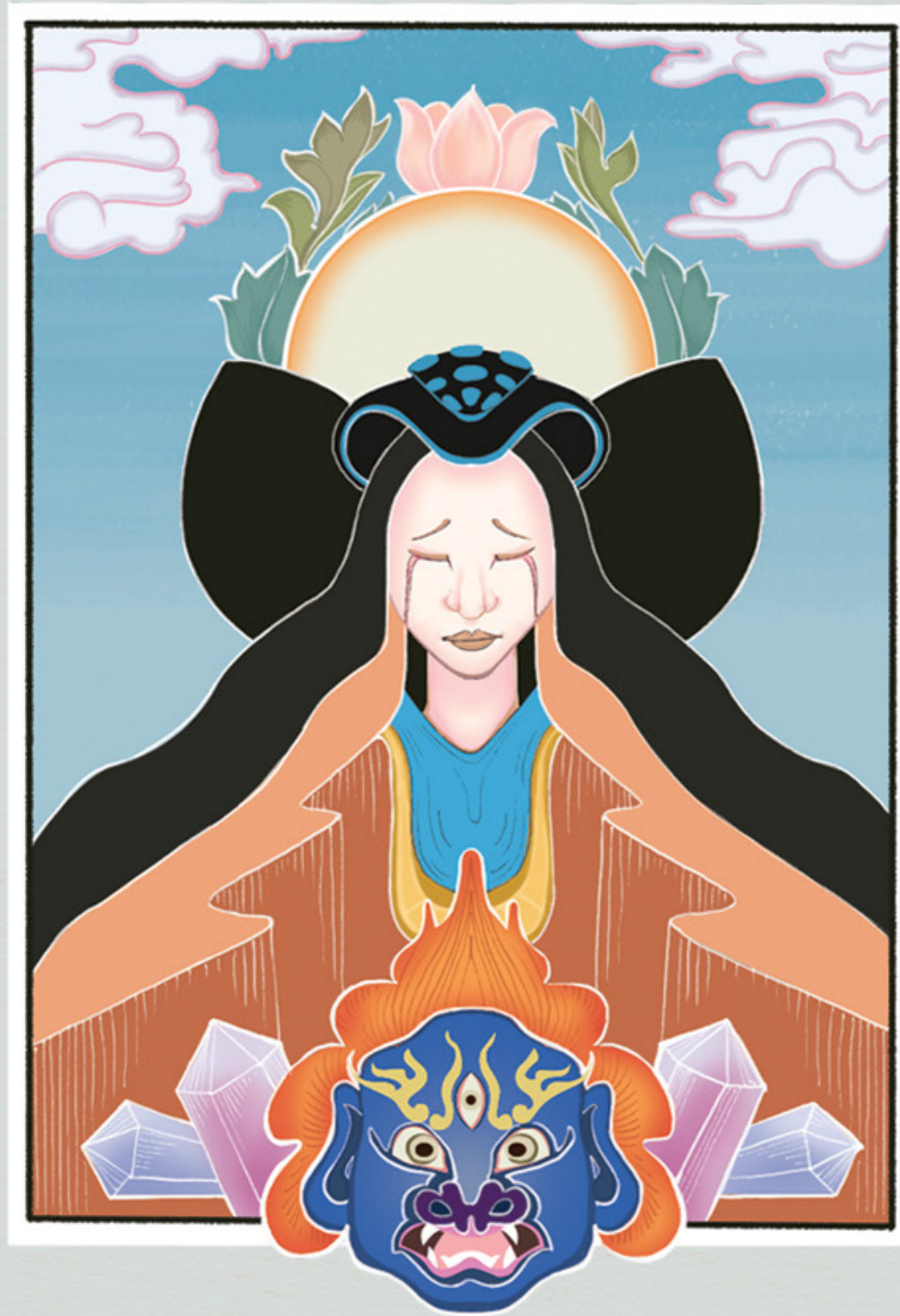
Folktale - The Fairy Who cried Gems

“Greed, in the end, fails even the greedy”